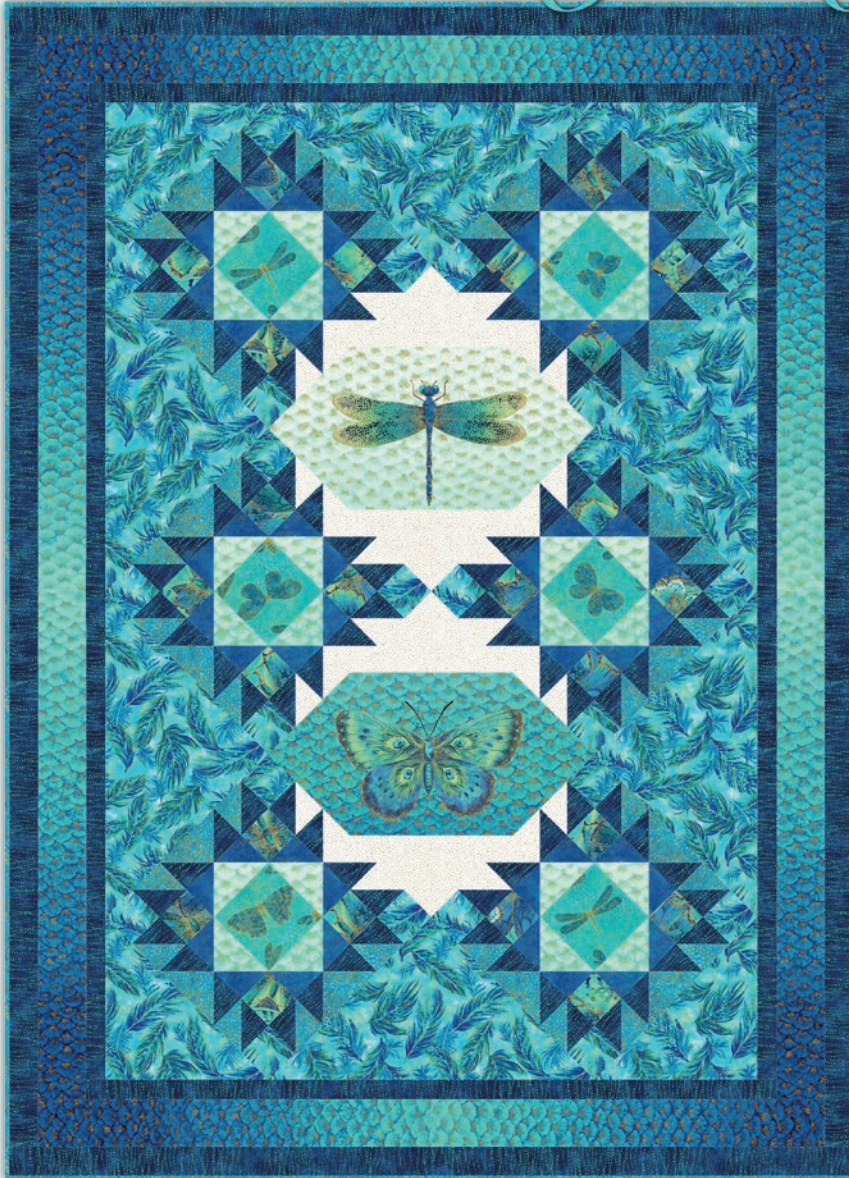
Bejeweled Wings • 44" x 61" • Pattern includes 2 size & color options

By Sue Harvey & Sandy Boobar of Pine Tree Country Quilts • www.pinetreecountryquilts.com