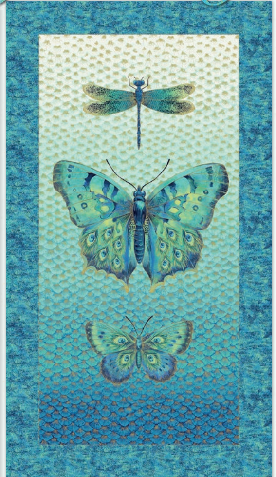
Lagoon colorway shown.

By Sue Harvey & Sandy Boobar of Pine Tree Country Quilts • www.pinetreecountryquilts.com